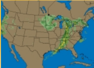
National WSI NOWrad Mosaic