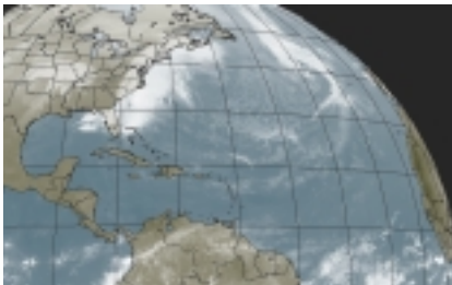
Tropical Atlantic Satellite Image