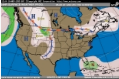
24 Hour Surface Prog