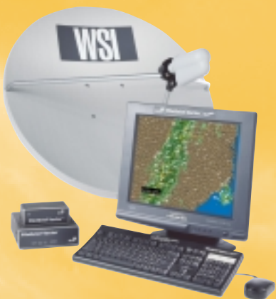
WSI Pilotbrief's Turnkey Weather Briefing Solution