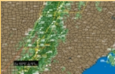
WSI Regional Radar Summary

Consistently voted the #1 weather service by professional pilots*, WSI Pilotbrief delivers fast, accurate weather briefings around the clock for an affordable, fixed monthly fee. Pilots demand reliable access to the highest-quality weather information, radar and satellite imagery. With WSI Pilotbrief in your briefing room you provide the necessary mission-critical information from a system that pilots have learned to trust. No wonder it is the choice of the nations top FBOs, FAA Flight Service Stations, and corporate flight departments.